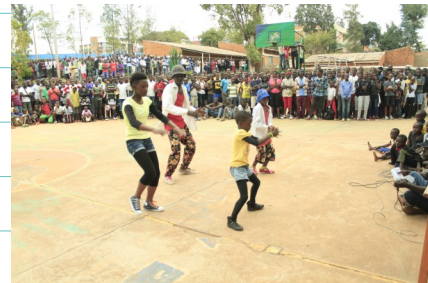
Performances interacting public

The competition wasn't only focused on the dancing skills but mostly on the knowledge these young people must have on sexual and reproductive health; Reason why for a crew to pass they were to pick a small piece of paper in a basket, on this paper was written a question that they were to answer just to test their knowledge on the topic, the public were there to listen and change behaviour.