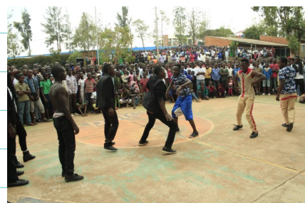
Urban Dance in Final with Kids of Unit

The best part about all this was that it wasn't only limited to the dancing crews, we had interactions with the public too, like one of our new peer educators (kids that were formed in my talent my health program) would ask some of the same questions to the public and see what they really know on the topics, it was marvelous to see young kids really focused when it came to debates.