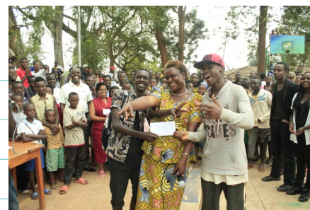
3rd place winners

third place to new heat crew, formers students of urban dance school. All we can say is that this event was a success and our message was properly delivered to the community.