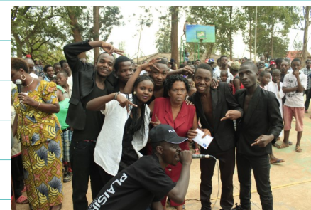
2nd place winners