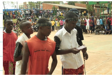
Crew answering questions

We hosted a dance event here at Club Rafiki on 20 March 2015, it was all about gathering as many people as we can to get to share knowledge with them and give them an overview on what really happens here at Club Rafiki. The event consisted of a dance competition and debates; We had 10 dance crews over, and most of those crew are from around Nyamirambo area, in those 10 crews 2 were from Urban dance school.