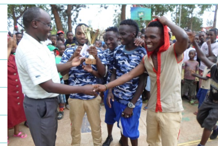
1st place winners